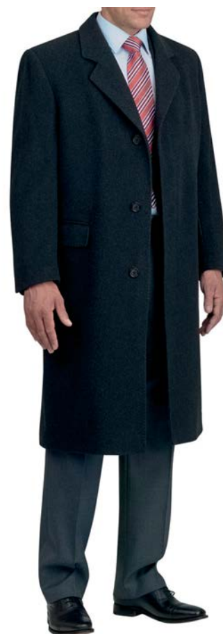
CROYDON Overcoat (Black) Single breasted, fly front, centre vent, satin lined, hand stitched edges.

60% Polyester, 20% Cashmere, 20% Polyamide