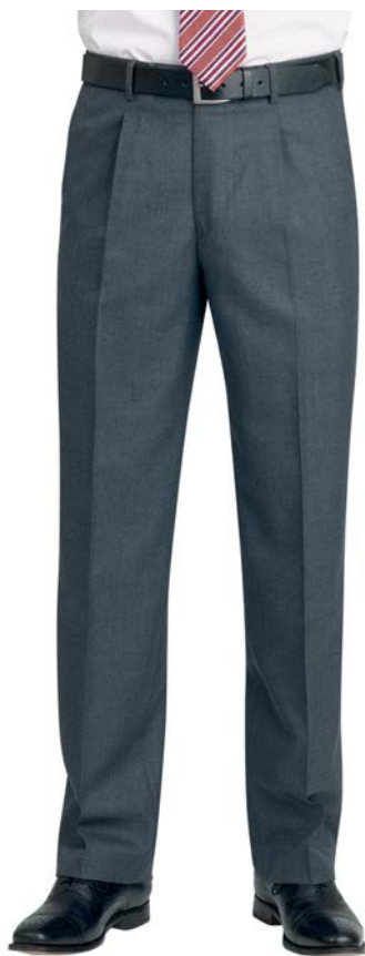
BRANMARKET Trousers (Mid Grey) Single pleat trouser, easycare, 1 hip pocket, French bearer.

Machine washable 55% Polyester, 45% Wool 420 grams per linear metre