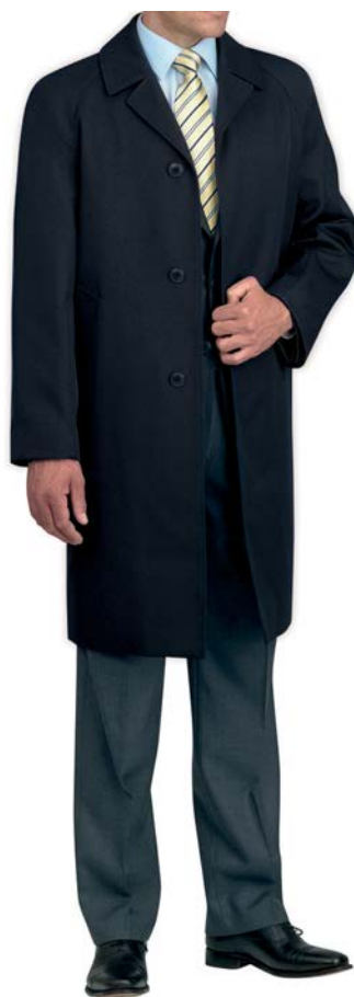
WHIPCORD Raincoat (Black) Single breasted, 3 button fly front, centre vent, raglan sleeve, viscose check lining.

Coordinates with Mix & Match Jacket on page 135